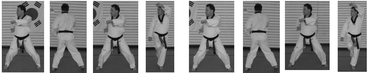
20b Juchum-sogi Kun-dolcho-gwi ← 20a 360°Drehung ← 19 Juchum-sogi Kun-dolcho-gwi ← 18 Hakdari-sogi Kumgang-makki ← 17b Juchum-sogi Kundolcho-gwi ← 17a 360°-Drehung ← 16 Juchum-sogi Kun-dolcho-gwi ← 15 Hakdari-sogi Kumgang-makki