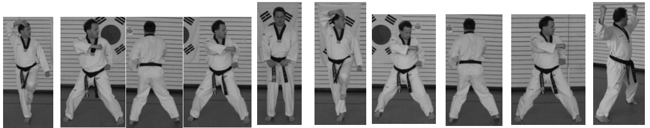
21a Sewo-an-Chagi tief ausgeführt ohne stampfen → 25 Hakdari-sogi Kumgang-makki → 26 Juchum-sogi Kundolcho-gwi → 27a 360° Drehung → 27b Juchum-sogi Kundolcho-gwi → Junbi → 8 Hakdari-sogi Kumgang-makki → 9 Juchum-sogi Kun-dolchogwi → 10a 360° Drehung → 10b Juchum-sogi Kun-dolchogwi → 14b Juchum-sogi Santul-makki