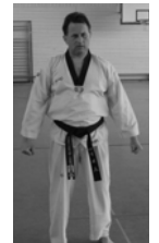
13 Pyonhi-sogi Arae-hecho-makki