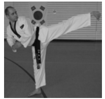
18 Yop-chagi Jumok-pyojok (siehe Bild 22 -> 23)