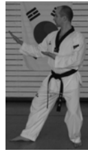
5 Dwit-gubi Sonnal-makki