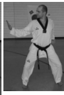
21 Juchum-sogi Hansonnal-yop-makki