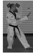
1. Dwit-gubi Sonnal-makki