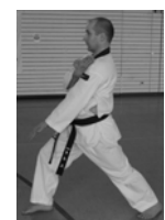
18a Ap-gubi Pyonson-kut-jochoy-chirugi

12a = Ap-chagi 12b = Ap-gubi Murup-kokki