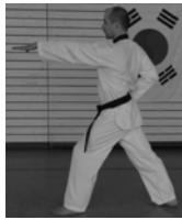
6c Ap-gubi Sonnal-bakkat-chigi