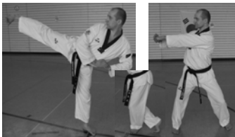
23 Yop-chagi Ap-Koa-sogi 22 Jumok-pyojok-jirugi