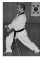
14 Ap-gubi Ogoro-arae-makki