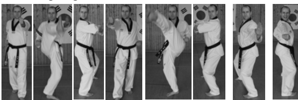
18 19a 19b 20 21a 21b 22 23