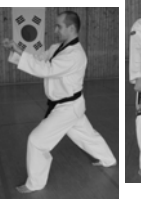
12 Ap-gubi Momtong hechyo-makki