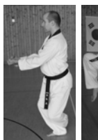
13b Koa-sogi Du-jumok-momtong jochoy-jirugi