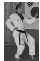
2b Bom-sogi Momtong-an-makki