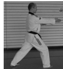
2 Ap-gubi Batangson- nullo-makki mit Sonkut-chirugi