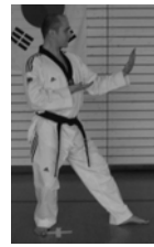
1 Dwit-gubi Sonnal-makki