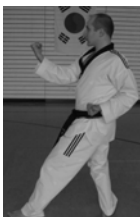
10b Dwit-gubi Momtong- an-makki