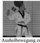
Ausholbewegung zu 1