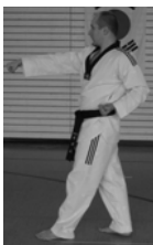
15b Momtong Kwon-jirugi