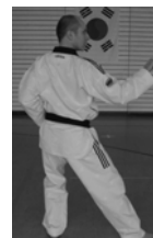
11 Dwit-gubi Bakkat-palmok Momtong-makki