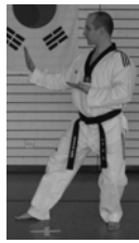
3 Dwit-gubi Sonnal-makki