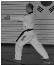
4 Ap-gubi Batangson- nullo-makki mit Sonkut-chirugi