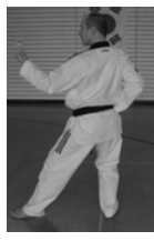
9 Dwit-gubi Bakkat-palmok Momtong-makki